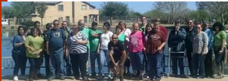
Nogales Wellness Connections and Benson Mobile Program at Rancho Sahuarita Lake